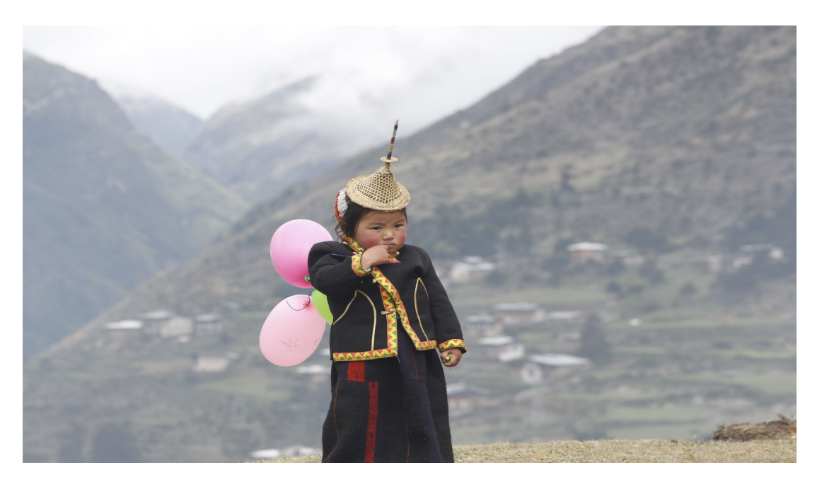
The Laya Run with the theme – "Run for the Highlands" was almost an event by itself was also a big success.

Thank you all the supporters and visitors for making the 2nd Royal Highland Festival – 23 to 24 October 2017 a grand success. The festival brought to Laya around 500 guests representing from all walks of life. The festival gave the guests their once in a lifetime opportunity to see and experience the otherwise an inaccessible Highland lifestyle and that too all in festivity and carnival atmosphere adorned with the Royal Presence of His Majesty The King.