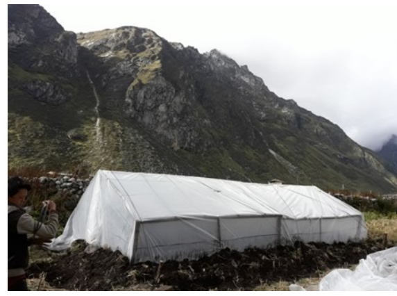
Figure 1: Low cost poly house

Situated at 2800-4500 meters above sea level, Lunana is one of the remotest geog in extreme northwestern part of Gasa Dzongkhag. The geog comprises of five chiwogs which are sparsely distributed to each other. It has total of 183 households with a population of approximately 1000 people residing in the geog. Lunaps eventually experienced in shortage of fresh vegetables for consumption almost throughout the year due to harsh climatic condition to grow vegetables and lack of improved technology and knowledge in high altitude farming. Thus, in order to combat such situation, Dzongkhag Administration and Agriculture sector of Gasa has