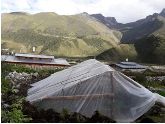
Figure 2: Semi-trench poly house

The conceptualization of low cost poly house construction in highland region for vegetable cultivation was observed to be promising one, however upper villages of Lunana geog is situated at tree line region experiencing strapping wind whereby trench-poly house construction is