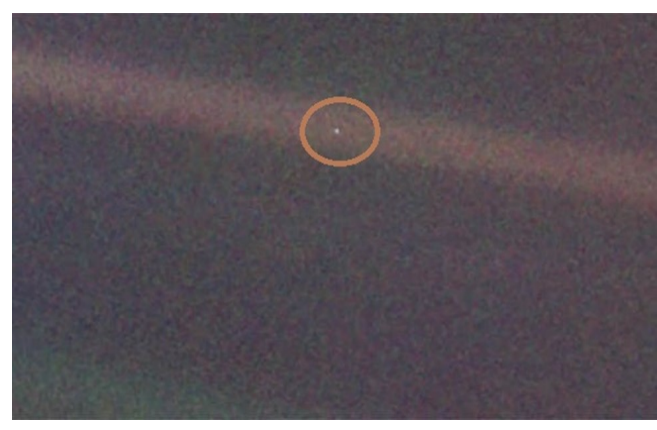
Carl Sagan Pale Blue Dot

It was on the Valenday's day, 1990 that the Voyager 1 spacecraft completed its mission and was leaving the solar system. The scientist and author Carl Sagan pleaded officials to turn around the camera to take one last photo of the planet Earth. The photograph was taken from the distance of 6.4 billion kilometers. The resulting image of the planet earth which can be seen