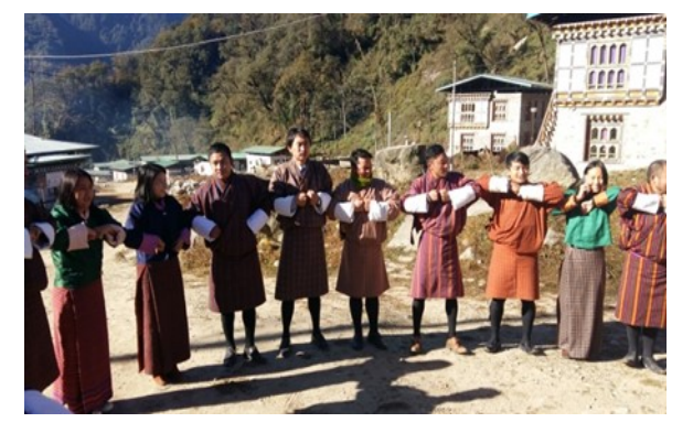
Teachers readying for the movers